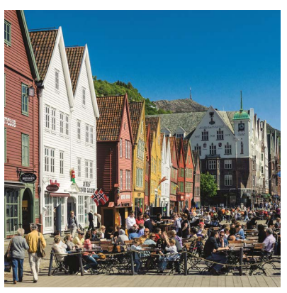
Local bar and restaurant