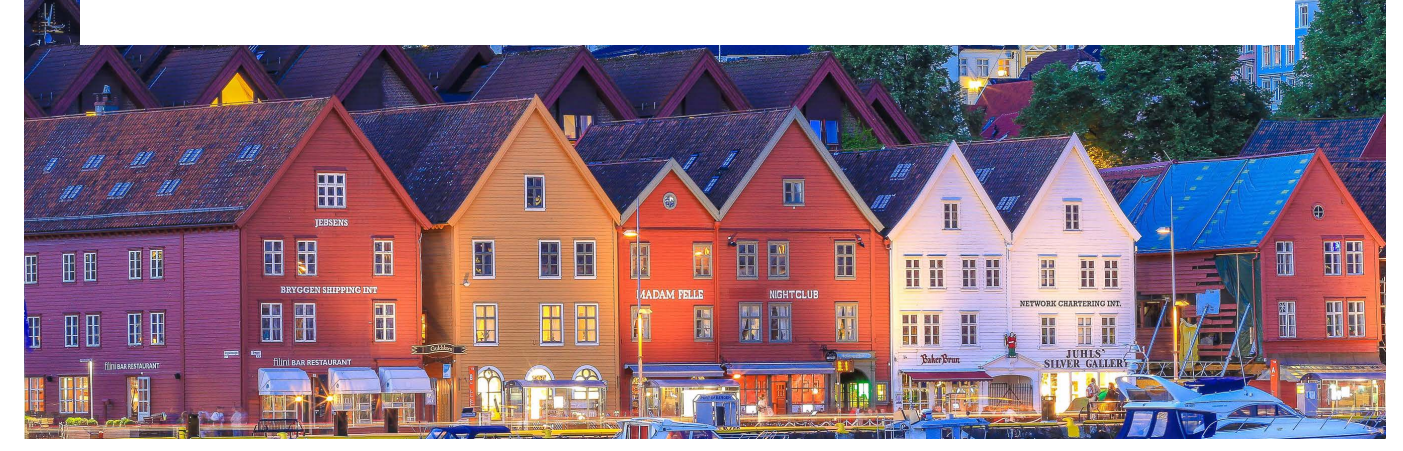
With its perfect blend of urban charm and natural beauty, Bergen is one of Norway's most beloved destinations.

The city's charming old town features narrow streets, colourful wooden houses, and the UNESCO World Heritage-listed Bryggen district, once the heart of the Hanseatic League's trading empire. Today, Bryggen's historic buildings house shops, restaurants, and museums, offering a glimpse into Bergen's past as a key trading hub. The city is also home to a thriving arts and music scene, with numerous festivals, museums, and theatres to explore.