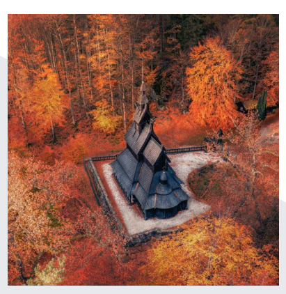
Fantoft Stave church