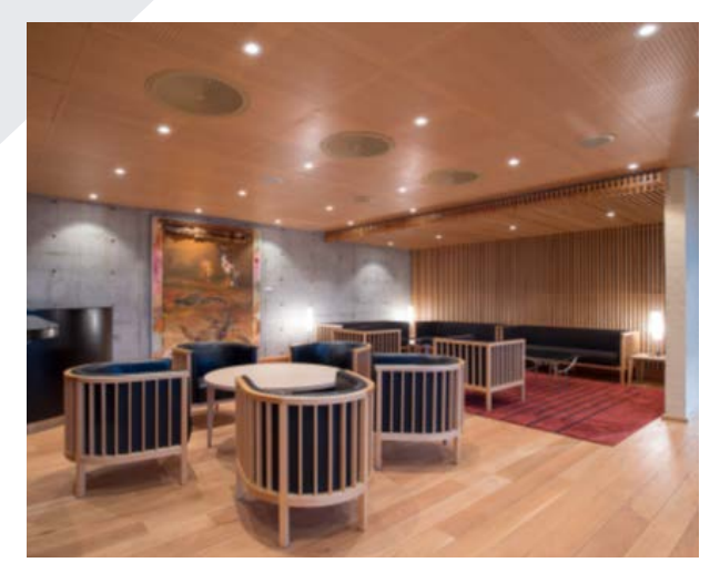
Breakout rooms for the Organising Secretariat, ECPHM Board meeting room and Preview room