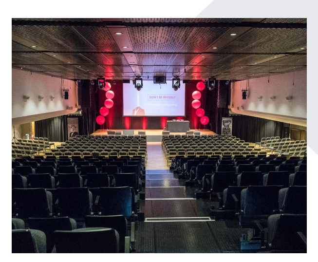
Peer Gynt – Parallel Sessions (level 2)

The Peer Gynt Hall is a versatile multipurpose space (750 sqm), suitable for events, banquets, concerts, conferences, meetings, exhibitions, and entertainment.