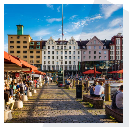
The fish market